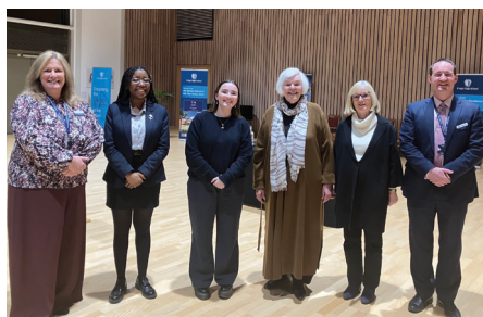
The 2025 Landor Lecture