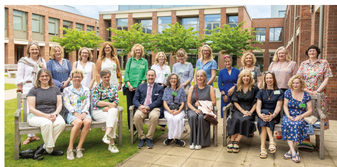
The class of 1985 at their reunion in 2025

While there is no charge to attend, please register in advance on https://forms.office.com/e/v14GZFW4qs .