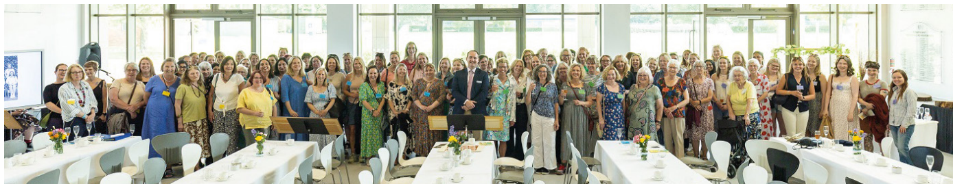
The 2025 Anniversary Reunions