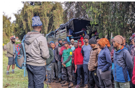
Kilimanjaro Mountain Guiding students before their final climb