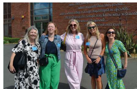
Friends from the class of 1995