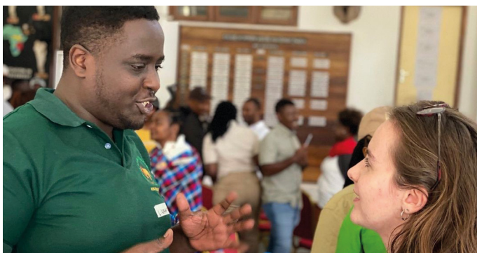
Speaking to a member of the College of African Wildlife Management at the 2024 Sustainable Guiding Summit in Tanzania